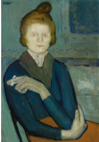
fig. 19 Pablo Picasso Young Woman holding a Cigarette , 1901 Oil on canvas, 73.7 × 51.1 cm The Barnes Foundation, Philadelphia