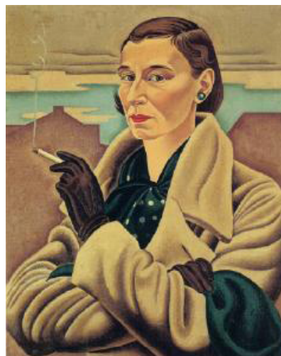
fig. 23 Rita Angus Self-Portrait , c. 1937 Oil on canvas mounted on panel, 49 × 40 cm Dunedin Public Art Gallery