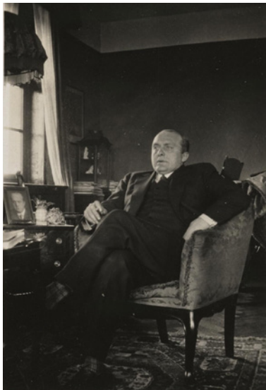
fig. 13 Max Beckmann sitting on an armchair