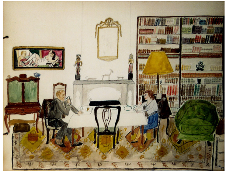
fig. 14 Mathilde Q. Beckmann Max and Mathilde Beckmann at the Dining Table in their Living Room Table, Rokin 85, 1937 Pencil, watercolour, and Indian ink on paper, 24.3 × 32 cm Private collection

The composition of Quappi in Pink Jumper revolves around the figure seated on a deep-buttoned blue armchair. 36 The background, resembling a backdrop, is patterned wallpaper a very similar colour to the subject's jumper.