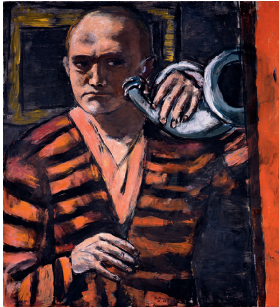
fig. 17 Max Beckmann Self-Portrait with Horn , 1938 Oil on canvas, 110 × 101 cm Neue Galerie, New York, and private collection