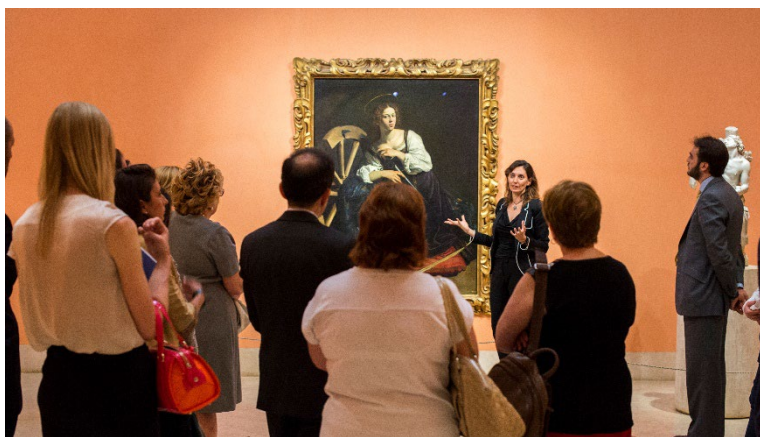
Private tours of the Thyssen-Bornemisza permanent collection and the Carmen Thyssen collection during summer opening hours and on Saturdays all year round, while the Cafeteria and temporary exhibitions remain open.